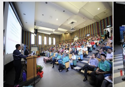
Pekan, 9 Mac- Warga Universiti Malaysia Pahang (UMP) berpeluang berkongsi pengalaman dan menyenangi cabaran kepimpinan memainkan peranan yang penting dalam syarikatnya sebagai peneraju kepada kemajuan teknologi komunikasi masa depan.